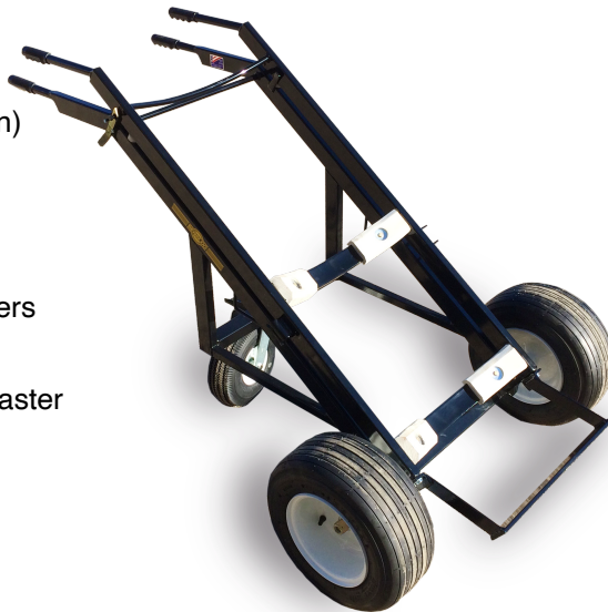
SHOWN WITH OPTIONAL KICK PLATE