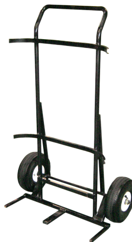
RTC33-Scoop v. 2001 - 2006. Notice the absence of the two center tank support brackets from the model pictured to the left.

The configuration of your dolly may differ from the one depicted in this instruction manual. Units manufactured prior to 2007 are not capable of transporting 20 LB grill cylinders, without modification.