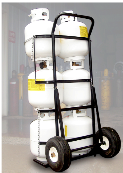
RTC33-Scoop v. 2007.