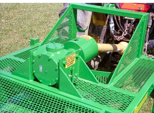
100 HP Bondioli & Pavesi Gear Box and Drive Line.